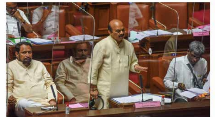
Karnataka CM Basavaraj Bommai.